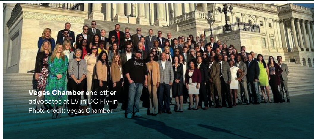
Vegas Chamber and other advocates at LV in DC Fly-in